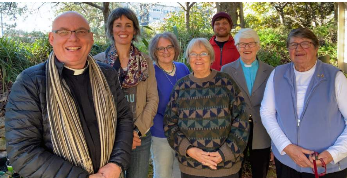
THE MINISTRY TEAM

This is your opportunity to become a great neighbour. Will you step out and discover God's abundance with us together?